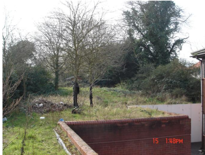
Rear garden area