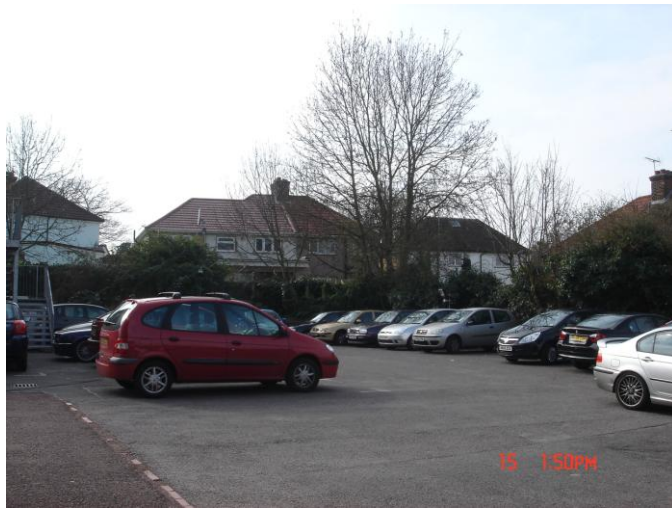
Existing rear car park