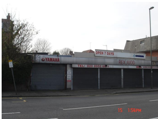
Original front elevation